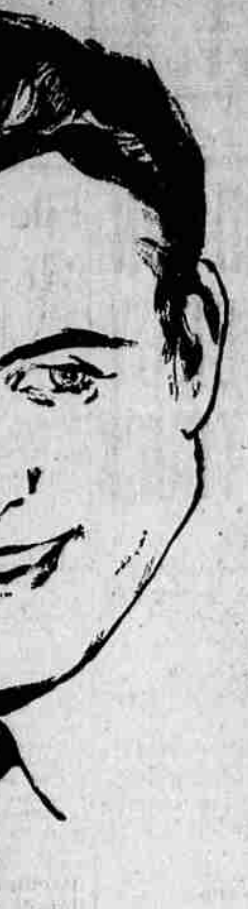
P. A. is sold everywhere in tidy red tins, round and half-pound tin humidor, and pound crystal glass humidor with sponge-moistener top. And always with every bit of bite and punch removed by the Prince Albert process.