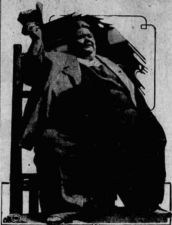
Tom Tom has just reached Chicago from California—the whole 145 pounds of him. Getting into a berth on the train was out of the question, so he rode in the baggage car, where the porter used half a carload of mattresses to improvise a bed for him.