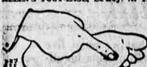
Most Common of Foot Troubles

Stops the pain of Corns and Bunions and you can walk all day in ease and comfort. Soothing gives quick relief to hot, tired, swollen, inflamed or swollen feet, blisters or calluses. A little ALLEN'S FOOT-EASE sprinkled in each shoe in the morning will make you forgetful of tight shoes. It takes the friction from the shoe. Always use it for dancing and to break in new shoes. For Free Sample and Foot-Ease Vaseline Ointment, address ALLEN'S FOOT-EASE, Le Roy, N. Y.