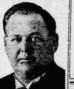
Claude C. Pratt Lumber Co.

SEATS NOW SELLING AT GLASS DRUGS. PRICES: $1.00—$1.50—$2.00—2.50—Plus Tax.