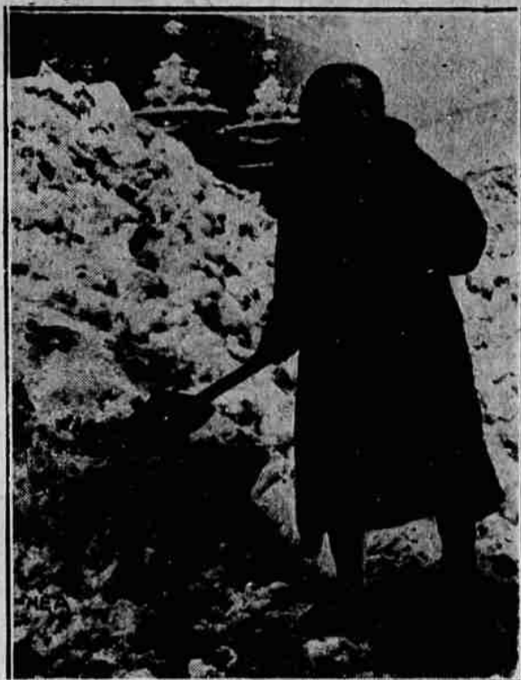
When the first day of April reached Chicago the Windy City folk thought February had returned by mistake. This photo shows how the snow was heaped up in front of a building on Michigan avenue.