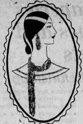
This new knotted necklace with earrings to match was worn with the smartest evening gowns at the French openings.