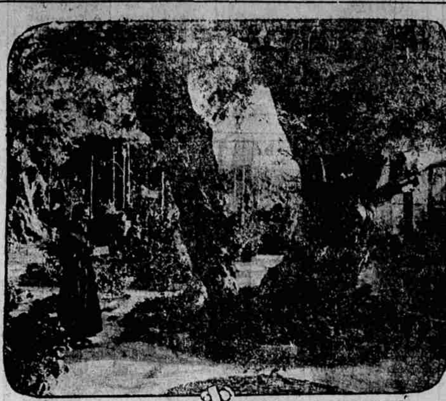
This is a photograph of the Garden of Gethsemane, on the outskirts of Jerusalem, where Christ went to pray after the Last Supper, on Thursday of Holy Week. Franciscan monks are keeping the garden in good condition.