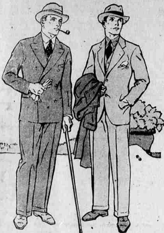
Hart Schaffner & Marx

Home of Golden Crust The Made-To-Sell-More Products.