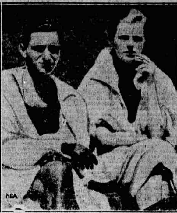
Irving Berlin, song writer, and his society bride, Ellin Mackay, are now in the Madeira Islands on their honeymoon. This exclusive picture was taken as they napped themselves on the rocks after a dip in the sea.