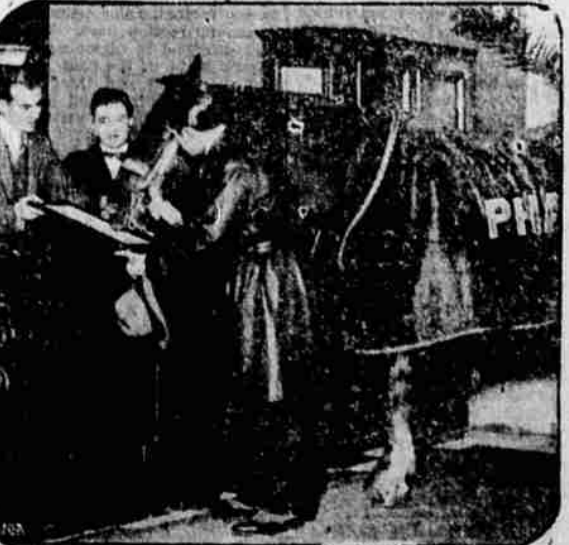
"Phantom," wonder horse brought to America from Egypt and way points to act in the movies, registers at a leading New York hotel preparatory to attending a big dinner party in his honor.