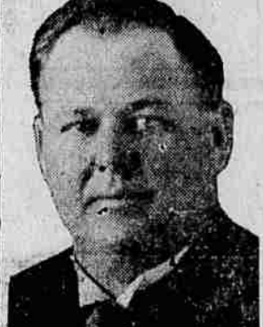
He could talk like a Dutchman

The $400 credit does not apply to the wife or husband of a taxpayer, though one may be totally dependent upon the other.