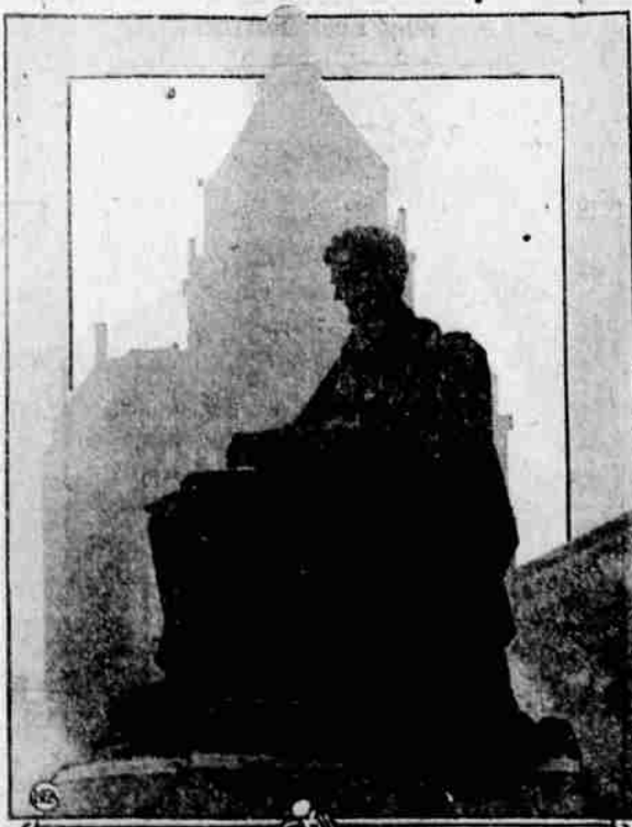
St. Gudens' seated figure of Abraham Lincoln—the statue which the sculptor hoped would be the crowning work of his career—was finished 20 years ago, but has been kept in a shed in Chicago ever since because Grant Park, where it was to be placed, was not finished. Now it has been mounted on the Chicago lake front, however, ready to be unveiled on Lincoln's birthday.