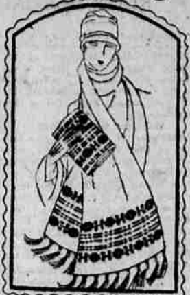
Here is a green and beige hand woven wool scarf with a bag to match. The design is woven in orange. This is an ideal skating accessory.