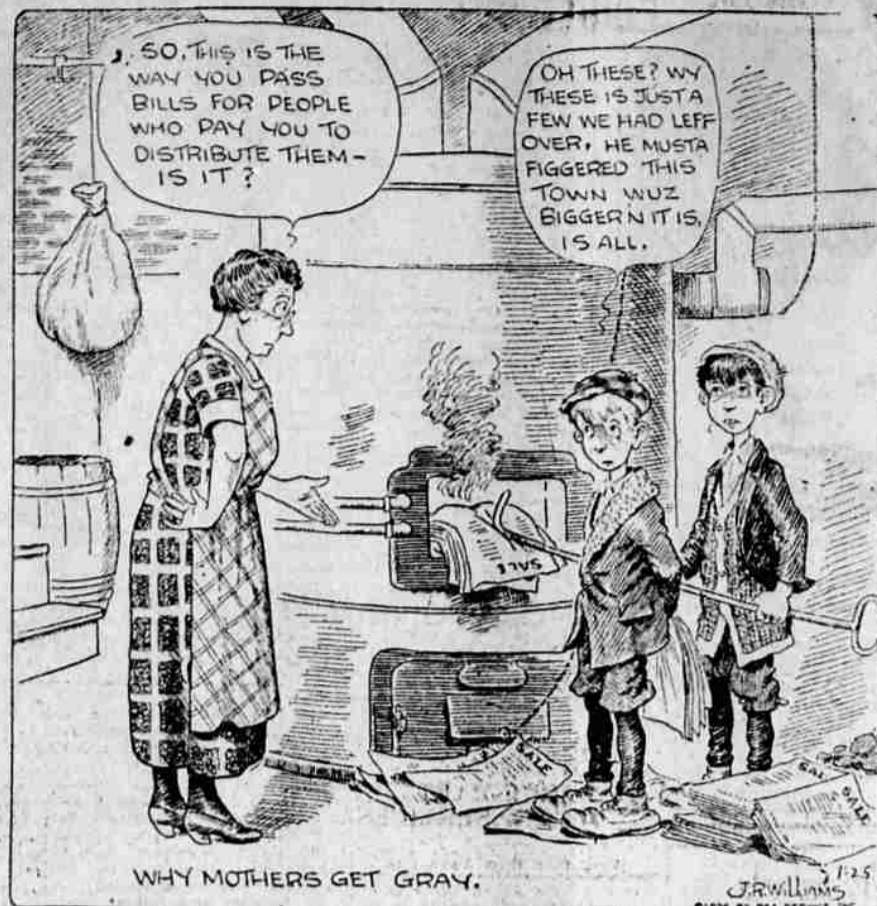
WHY MOTHERS GET GRAY.