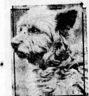
A TRUE VETERAN is "Rags," mascot of A. E. F. and now stationed at Fort Hamilton, N. Y. He's the only dog who went all through the World War, and he was gassed in the Argonne.