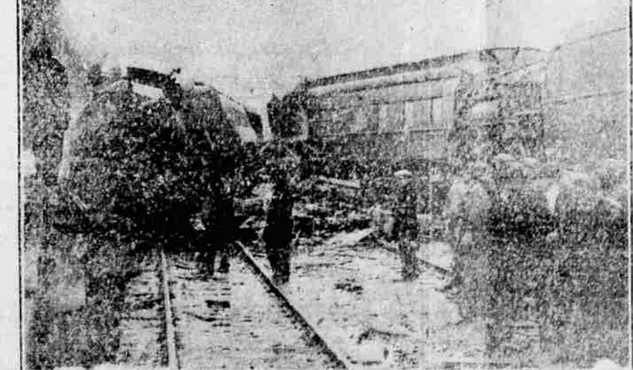
When the fifth section of the Twenty-ninth Century Limited, crash five of the New York Central, was being backed out of the Chicago depot yards the inbound six-section, traveling at a high rate of speed, crashed into it. Three persons were injured, one probably fatally, and scores of passengers were shaken up. Debris was scattered over four tracks. At the right of this picture can be seen the engine of the sixth section jammed into the rear Pullman of the fifth section.