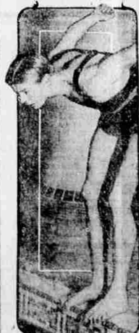
This is Arne Borg, sensational swimmer from Sweden, who has been cutting quite a few capers in swimming meets of late. He and Johnny Weissmuller, the Illinois sensation, have been teaming together around the country and have hung up several new records. Borg is considered one of Weissmuller's greatest rivals in the water sport.

the Russian home, dancing has long since disappeared, as the average city family lives in a single room.