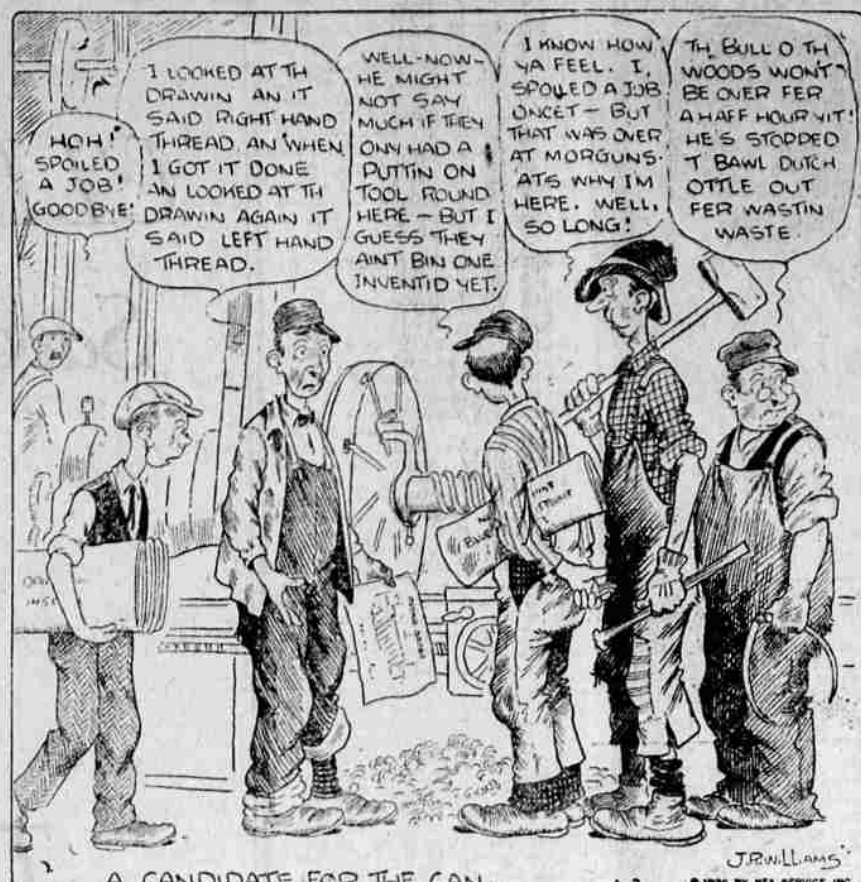
A CANDIDATE FOR THE CAN.