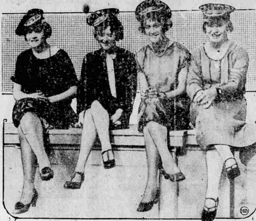
Telegraph companies in Washington have found girls make more efficient messengers than boys. Hence these four have been given pretty caps and told to go to it.

Lowly, Destiny Contrasts Million or So Mustangs... PORTLAND, Ore. (AP)—Out of the glories of mountain range and plain into the soap vat or fertilizer bin is the ignominious destiny that awaits in prospect for the western mustang—small, mostly useless, and numerous.