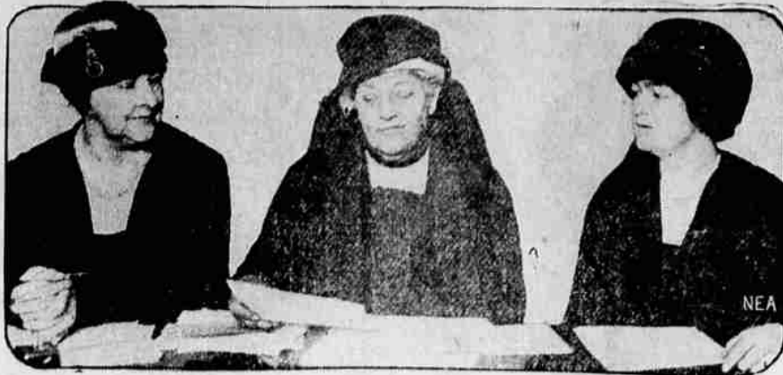
Here are the three new women members of the new congress. They are, left to right, Mrs. Mary T. Norton of New Jersey, Mrs. Florence P. Kahn of California, and Mrs. Edith Rogers of Massachusetts. From their eyes are cast down, it appears they aren't as used as most congressmen to having their pictures taken.