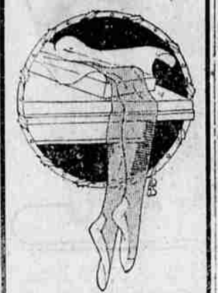
Ladies' Silk Hosiery. Spuntex, Guaranteed