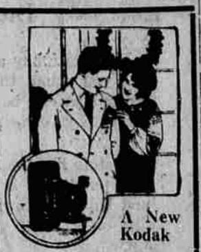
A New Kodak