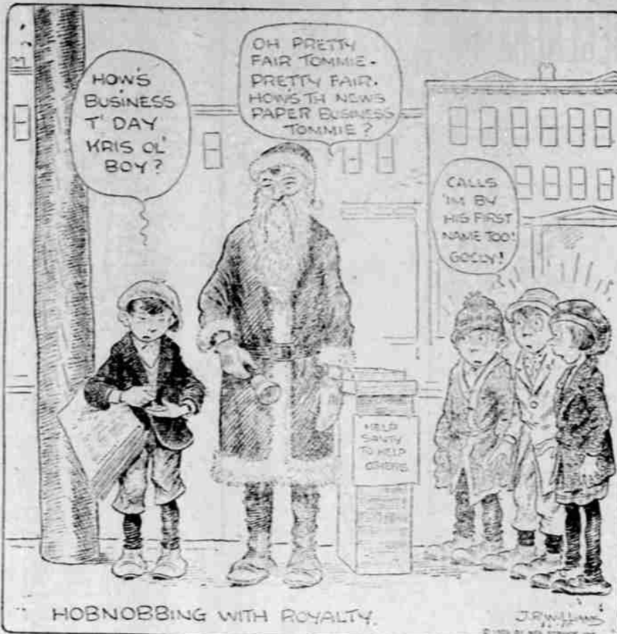
HOBNOBBING WITH ROYALTY.