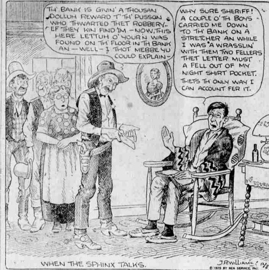
WHEN THE SPHINX TALKS.