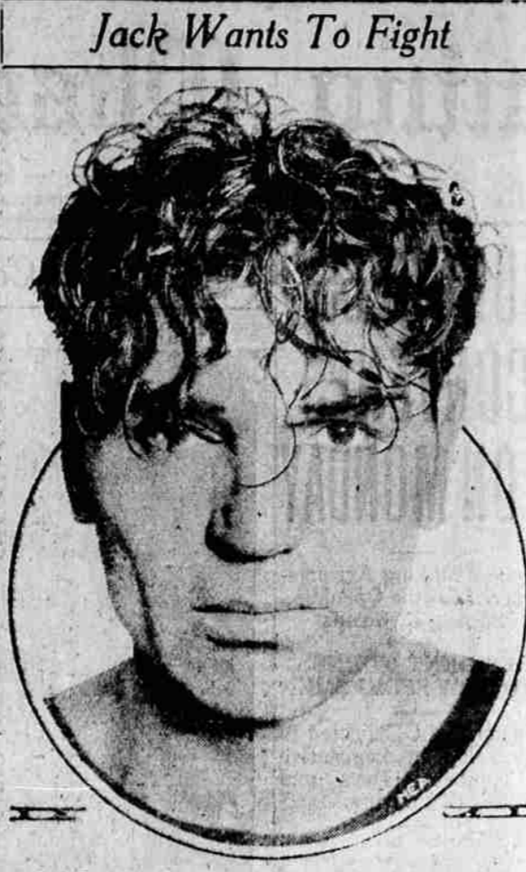
Jack Dempsey, heavyweight champ, poses as of old—the fighter. He says that he wants to fight and admits he wasn't made out for tea and chatter; but also admits that money comes first in his young life, movies or prize ring.