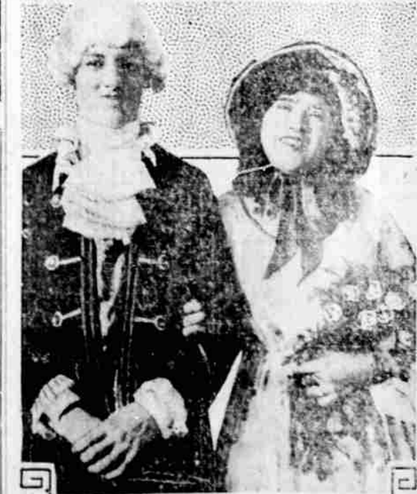
Recent LaGrande and Greenview residents shared a splendid wedding of recent continental celebration at LaGrande, Ind. The crowd thought it was only in fun but later learned it was a real marriage.