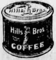
In the original Vacuum Pack which keeps the coffee fresh.