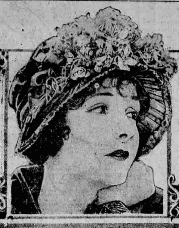
Norma Talmadge is above pictured in "The Lady" which opens at the Arcade theater Monday.