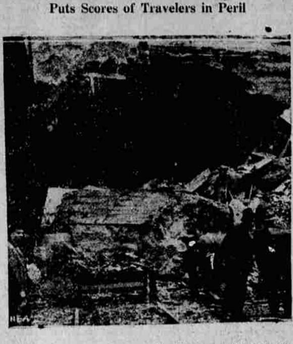
Lives of many passengers on the Pittsburg & West Virginia railroad were imperiled when a 125-ton boulder, loosened by heavy rains, crashed down from Mt. Washington, Pittsburg, crushed a portion of the railroad bridge and blocked a tunnel which is the road's only entrance to the city. A passenger train had passed through a short time before. Photo shows debris blocking the tunnel mouth and defying workmen's efforts to remove it.