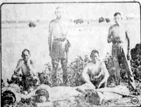
When the Yellow River flooded its banks in China it swept only a small zone from this country, but in China it means hundreds of thousands and a tremendous amount of suffering. This exclusive photo shows four destitute Chinese watching over the bodies of their children, drowned when a dyke gave way.