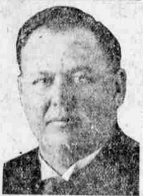
Each and every dollar that you put through our hands only means lower prices for you in the future. For many years we have had in mind the kind of success that we are growing into. A sane man has sane ways, you know, and as we were handicapped with no capital it was hard for us to make the first start. We had even thought of forming a stock company, but as the country was already flooded with stock companies and many of them had proved a failure, we hesitated. You have enabled us, through your kind patronage to create a capital of our own. But we feel so indebted to you that we wish to declare you dividends on your money in the way of reduction of prices. We have several acres of land right in the gateway to the city of La Grande, and we have access to the Railroad firm. If we can be of any help to the farmers' organizations or the farmers as a whole, let us know your wants. I said "help." Honestly we don't care to rob anyone. The writer was raised in the Sunny South where the very spirit of "help one another" was formed. Many parties, quiting parties and slinking lines are going to be things of the past. Let us not forget our duty in helping one another. Nails, $1.25 base in keg lots.

Claude C. Pratt Lumber Co. "The Poor Man's Friend" Oppo. Foundry, Phone M-215 No Sunday Business