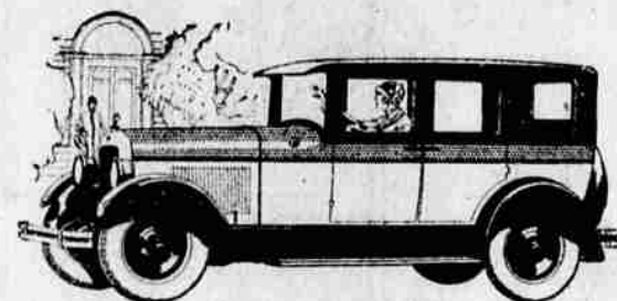
De Luxe Sedan $1680

Avoid the discomfort of getting a car out of a cold garage—avoid the cost of winter repairs. Reserve your storage space here today.