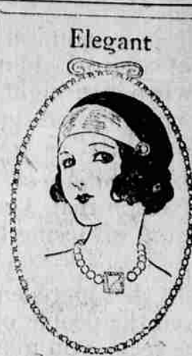
Elegant This necklace is made of large pearls and a square-cut emerald, bound on all sides by seed pearls. It is a most satisfying ornament for any woman to own.