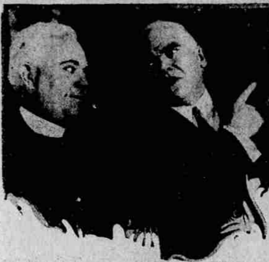
A scene from "Able's Irish Rose" which will come to La Grande for two performances tomorrow. Matinee will begin at 2:30 p. m., and the evening show will start at 8:15.