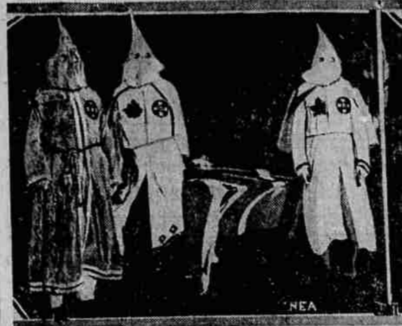
Entry of the Ku Klux Klan into Canada was heralded by the presence of thousands at a night open air ceremony near London, Ontario. The picture shows the imperial klirrapp and two imperial klirrappes waiting to administer the oath to new members.