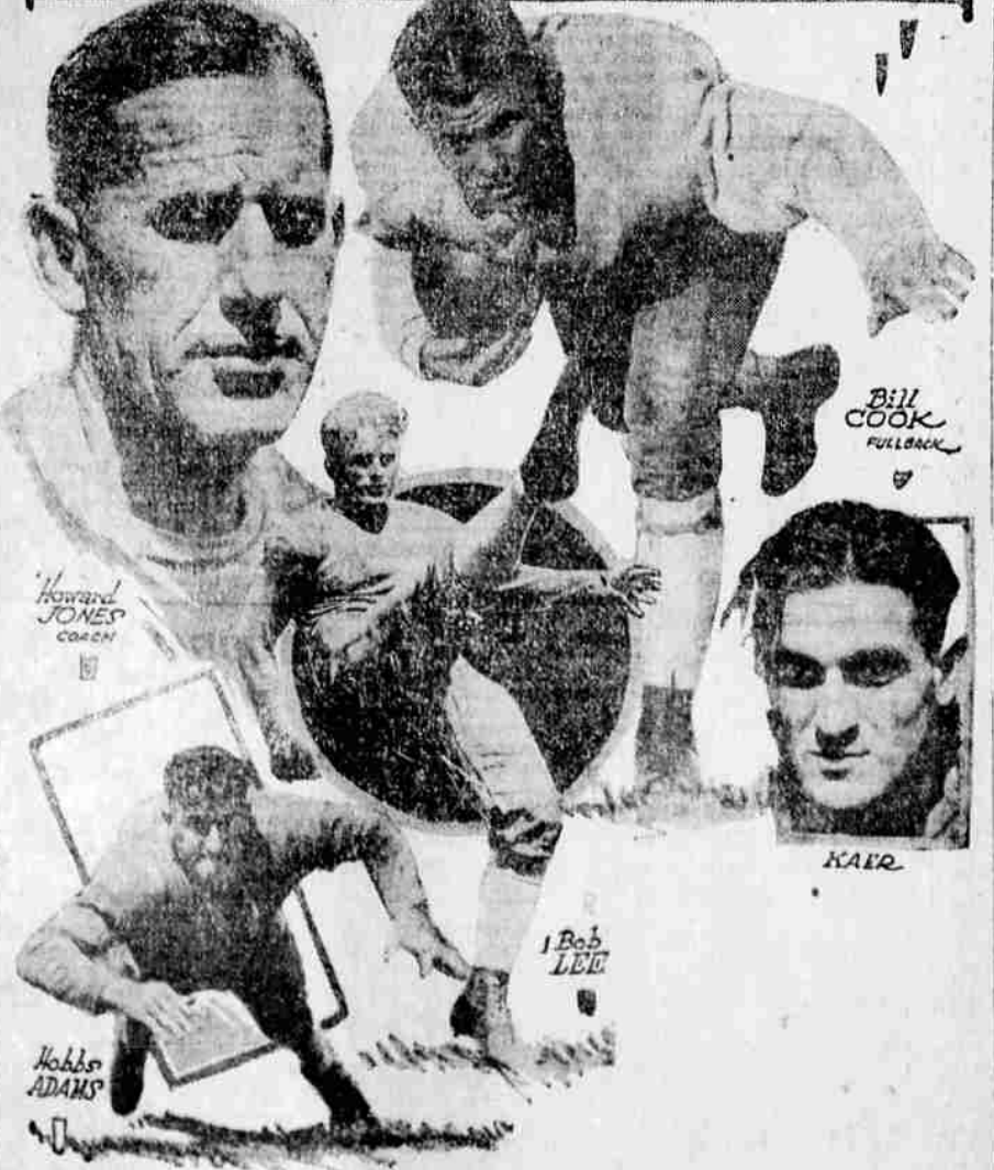
Poor fighting Trojans, and their coach, Howard Jones. Jones is the man who took the University of Iowa eleven east and beat Yale in 1922. He succeeded Gus Henderson at the University of Southern California this fall. Here he is with four of the men who will have much to do with the Trojan victories this season.