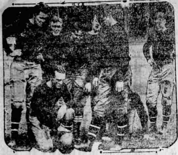
You've doubtless heard of Jim Thorpe and Hinky Haines as stars on the football field. Well here they are showing members of the New York Giants professional eleven just how to place kick. Haines is holding the ball.