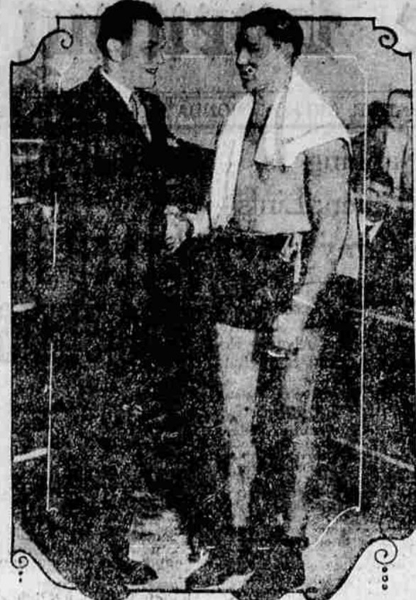
Here they are—Jack Dempsey and Gene Tunney in the same ring! But not to battle—at least not at present. The champion and challenger recently met in the ring at Dayton, O., where the titholder staged an exhibition match. You guessed it—Dempsey's the one on the right.