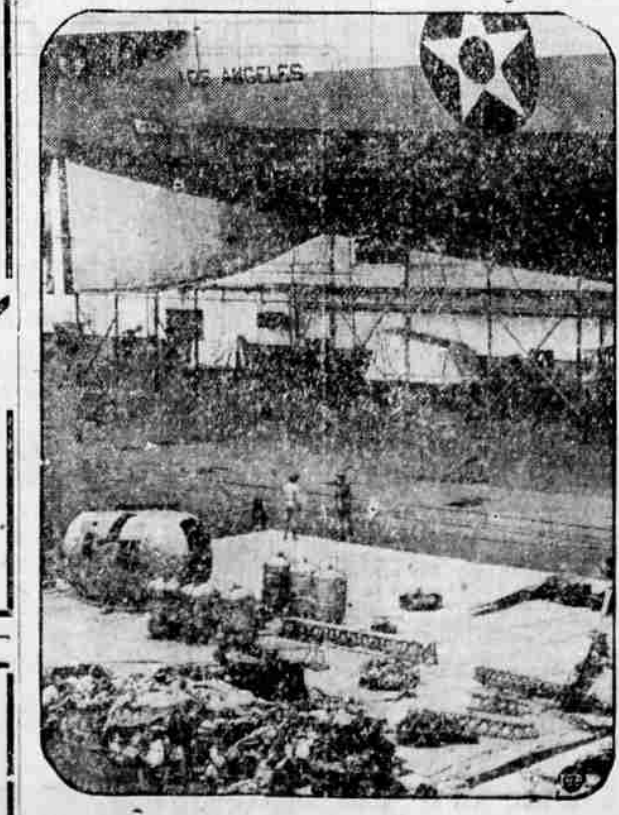
The wreckage collected from the dirigible Shenandoah, collected from the place it crashed in Ohio, was spread out on the floor of the hangar at Lakehurst, N. J., so that members of the Naval court investigating the tragedy could inspect it. It is shown here with the giant form of the Los Angeles looming high overhead.

W. H. Bohnenkamp Co. Four Floors of Fine Furniture.