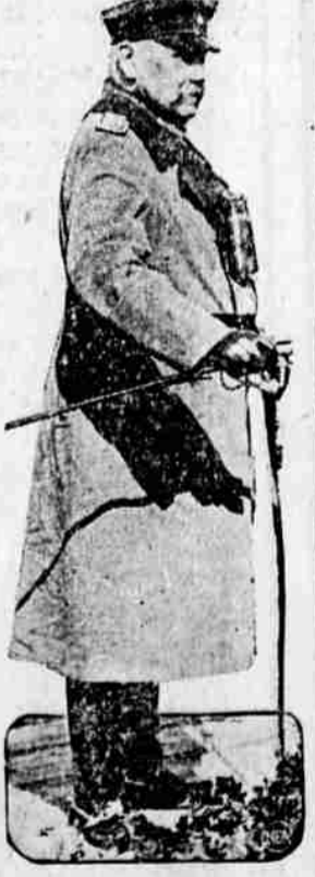
President von Hindenburg of Germany discarded his civilian clothes and appeared once more in the uniform of a field marshal when he reviewed the maneuvers of the reichswehr troops at Mecklenburg.