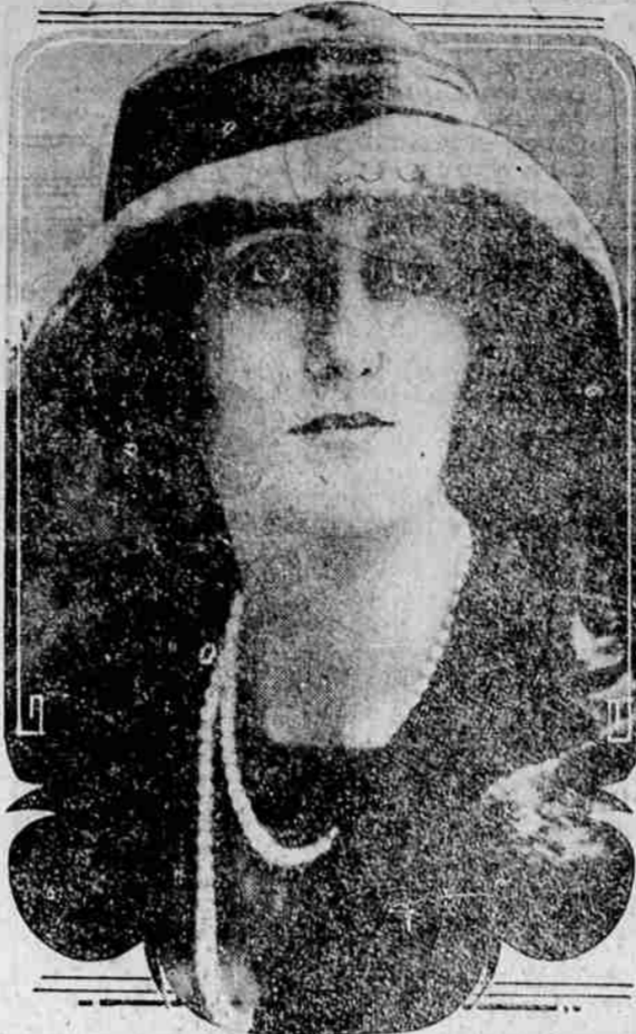
Lady Cynthia Mosley, attractive daughter of the late Lord Curzon, recently startled British aristocracy by addressing an audience as "Comrades" and stating that Socialism offered the only way out of Europe's present dilemma.