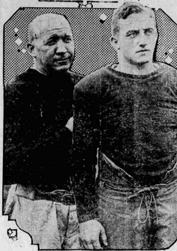
Coach Knute Rockne and Captain Clem Crowe have a tremendous task ahead of them if Notre Dame is going to live up to its arduous deeds of the past few seasons. With the celebrated "four horsemen" gone, as well as many other stars, it will take some real work to put the Irish on the football map this campaign. Rockne (on the left) and Crowe are shown in the accompanying photo looking over prospective candidates.

be a separate unit under the supervision of "men who have been in the air, not of men who have stayed on the ground or on the water."