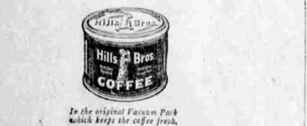
In the original Vacuum Pack which keeps the coffee fresh.