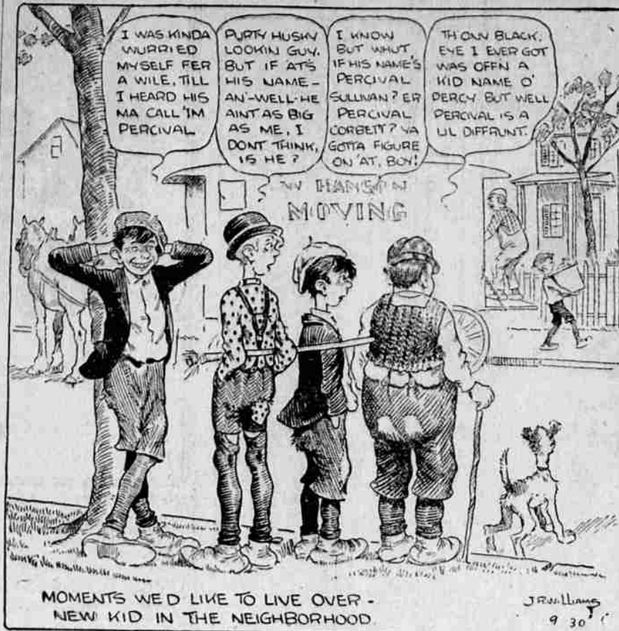
MOMENTS WE'D LIKE TO LIVE OVER - NEW KID IN THE NEIGHBORHOOD