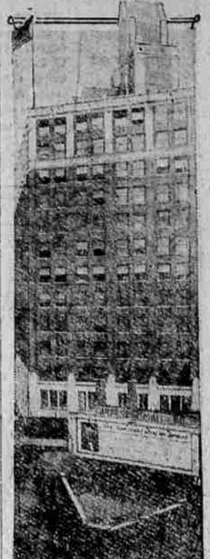
At a cost of $5,000,000, Rochester (N. Y.) Baptists have built this church of 14 stories. It contains 30 retail stores, 250 offices, and four rooms for church purposes. Rev. Clinton Wunder says churches in cities must build such structures if they wish to stay in the business district.

REGINA, Can. (AP)—Lard crabs in great numbers invade this city every evening shortly after sunset, crawling through the street in the lower section of town in search of scraps of garbage on which to feed. As a result, the affected sections have the appearance of a child's municipality. Authorities are unable to explain their presence.