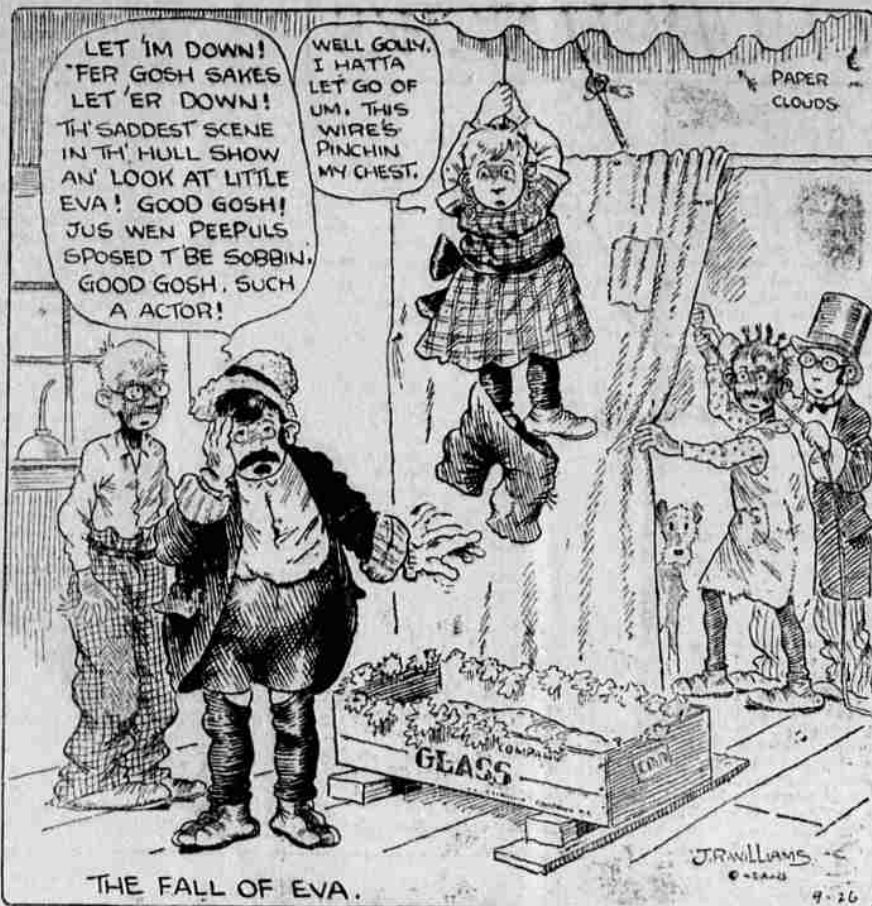
THE FALL OF EVA.