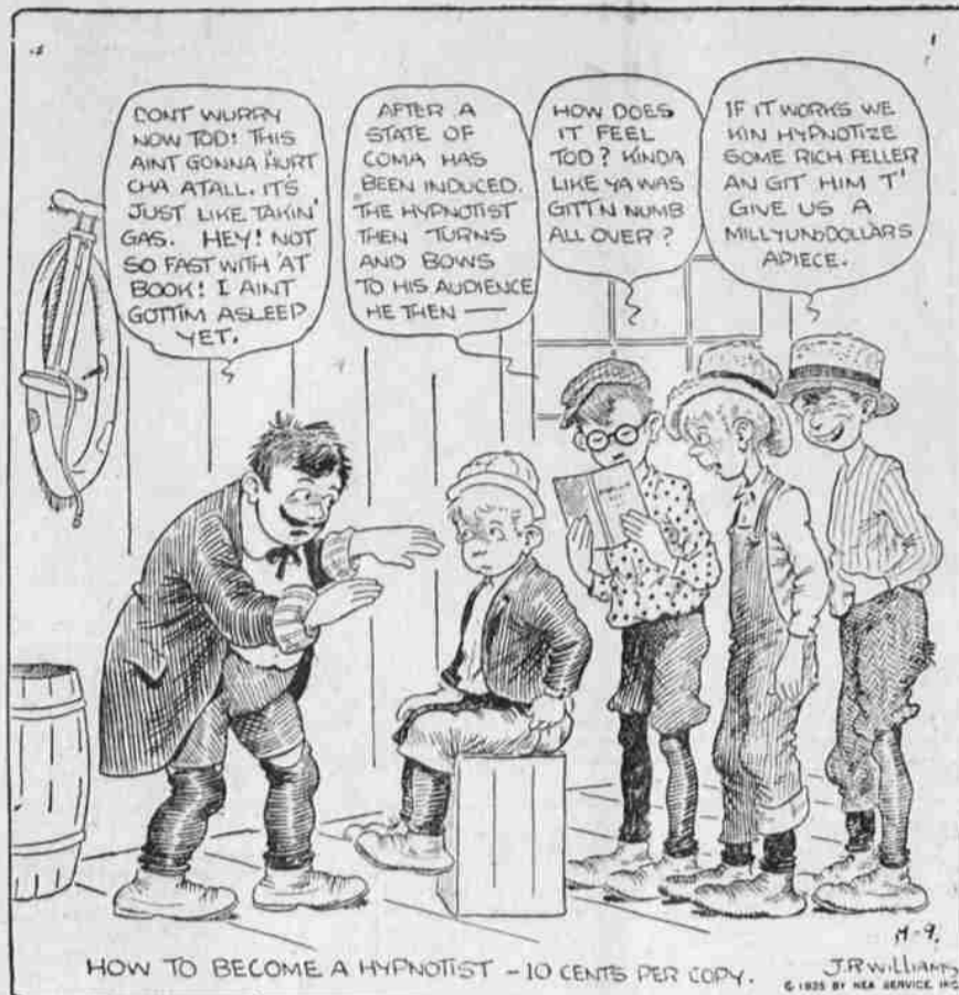
HOW TO BECOME A HYPNOTIST - 10 CENTS PER COPY.