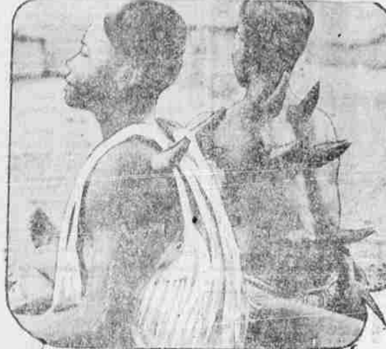
THESE NATIVES OF TOGA have gone the devil one better. Instead of having horns on their head, like just any ordinary quadruped animal may have, they attach the horns to their faces. Some distinction, eh, what!