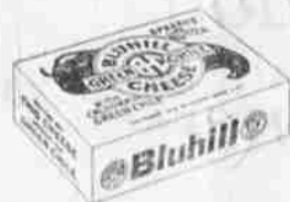
THE BEST TABLE FOODS