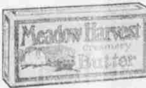
On THE MARKET TODAY