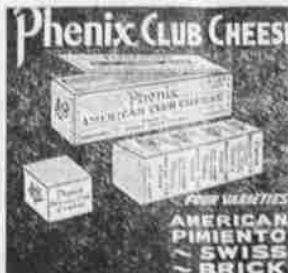
Union Creamery Company