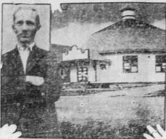
Although a J. Edgar Hoover is in command of the Watch, the school, which is conducted by the Young Workers League of America, says that the school is for the purpose of educating the youth in the principles of Communism.