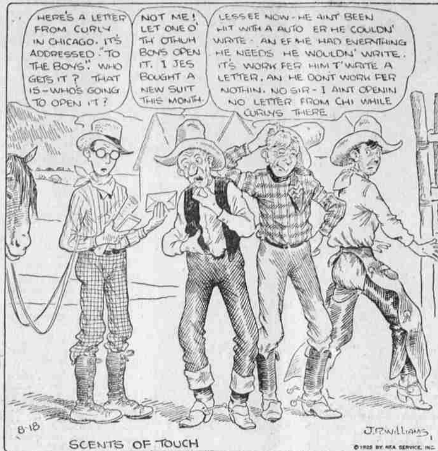
SCENTS OF TOUCH